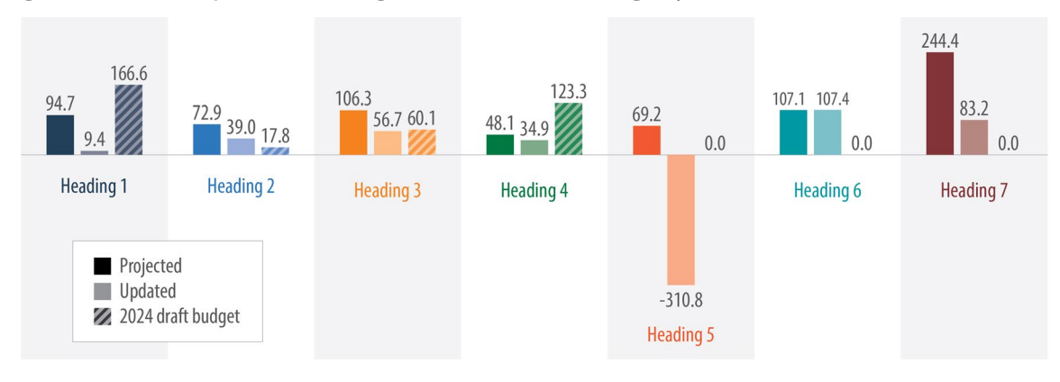
Figure 4 – Development of margins for the 2024 budget year (commitments, € million)

Data source: Financial programming 2/2021, 2/2023 and SEC(2023)250.