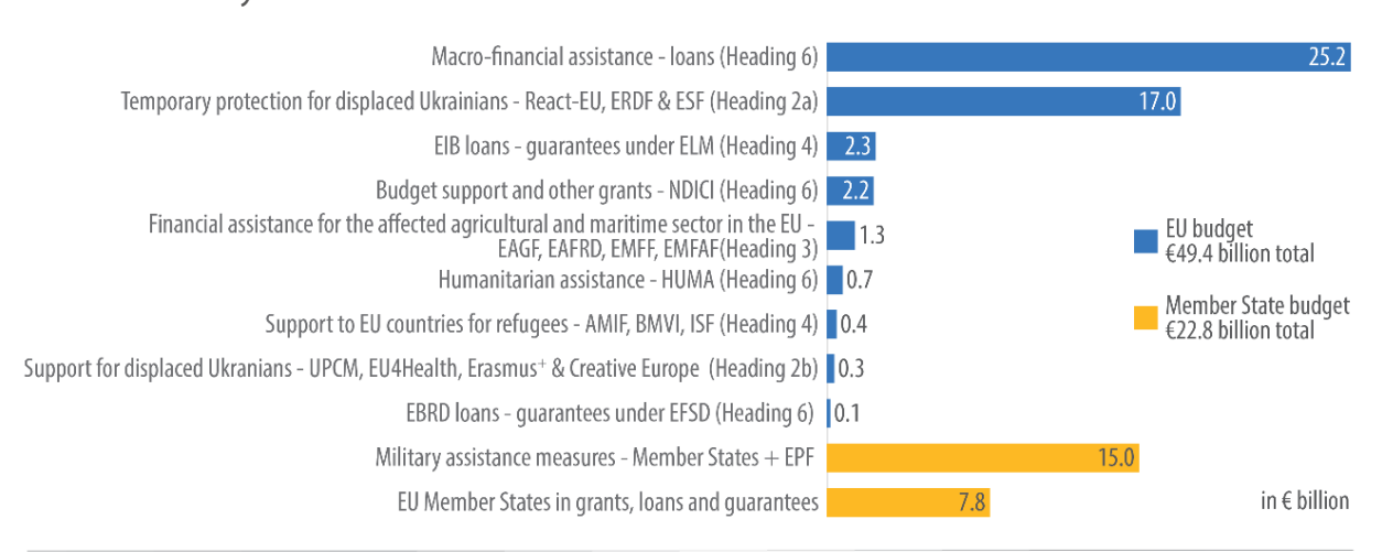
Figure 1 – Team Europe financial, humanitarian and military support for Ukraine totals €72 billion before the mid-term revision of the multiannual financial framework and the 2023 Ukraine Recovery Conference in London

Abbreviations: Recovery Assistance for Cohesion and the Territories of Europe (REACT-EU), European Regional Development Fund (ERDF), European Social Fund (ESF), European Investment Bank (EIB), External Lending Mandate (ELM), Neighbourhood, Development and International Cooperation Instrument (NDICI), Humanitarian Aid and Civil Protection (HUMA), European Bank for Reconstruction and Development (EBRD), European Fund for Sustainable Development (EFSD), European Union Civil Protection Mechanism (UPCM), Asylum, Migration and Integration Fund (AMIF), Border Management and Visa Instrument (BMVI), European Agricultural Guarantee Fund (EAGF), European Agricultural Fund for Rural Development (EAFRD), European Maritime and Fisheries Fund (EMFF), European Maritime, Fisheries and Aquaculture Fund (EMFAF) and the European Peace Facility (EPF).