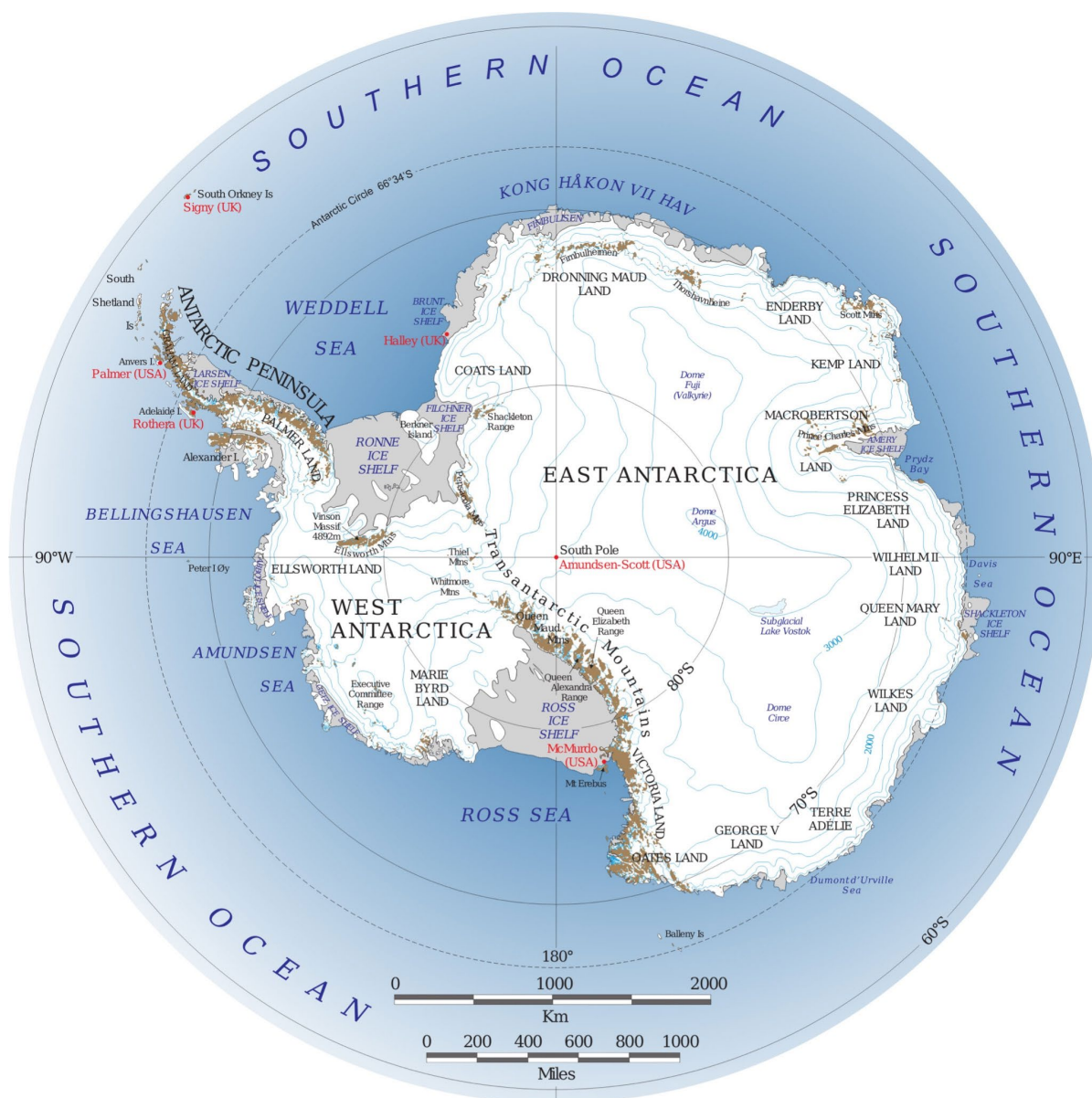
Figure 3. Map of Antarctica's landforms and ocean, including ice shelves. (Wikimedia, n.d.)

The Antarctic is the world's largest 'no-man's land'. To put the region in a polar context, while the Arctic is an ocean surrounded by sovereign countries, Antarctica is a landmass not officially belonging to any country, surrounded by oceans (see Figure 3). The Antarctic continent is 13.8 square million kilometres in size and contains 90 % of the ice on Earth. Antarctica is about 40 % larger than the European continent and the ice cap is up to 4km thick. Historically, there are seven claimant states: Argentina, Australia, Chile, France, New Zealand, Norway and the UK. Two other countries have been described as semi-claimants – Russia, and the United States – as they have reserved the right to make a territorial claim in the future. All other members of the international community do not have to offer any official comment on the validity of those existing claims on Antarctica, because the interests of all parties to the Treaty are protected.